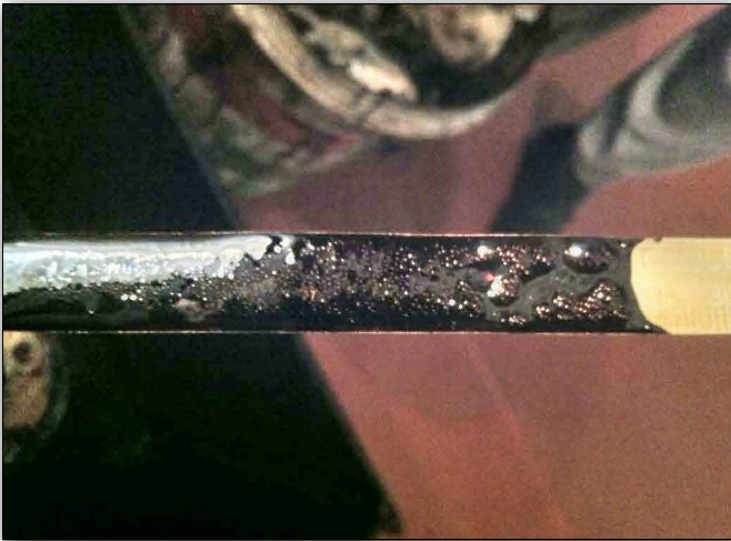
7- Bubbles seen on sounding tape