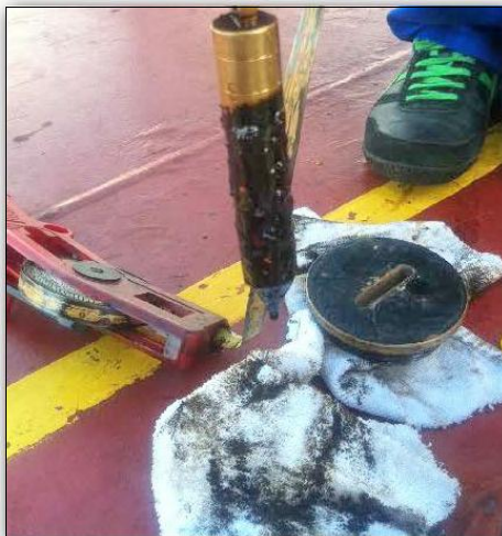
9- Bubbles seen on sounding bob