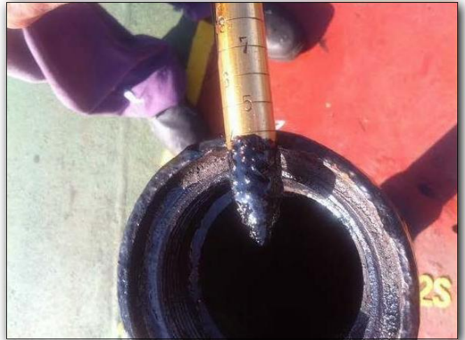
8- Bubbles seen on sounding bob