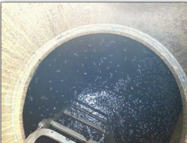
5- About 6 hours after bunkering - only light air bubbles seen - ullage 150 cm