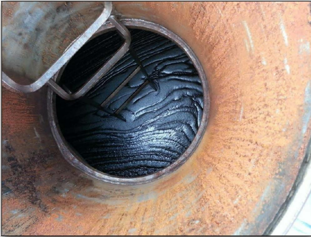
1- Entrained air / froth seen immediately following bunkering - ullage 139 cm