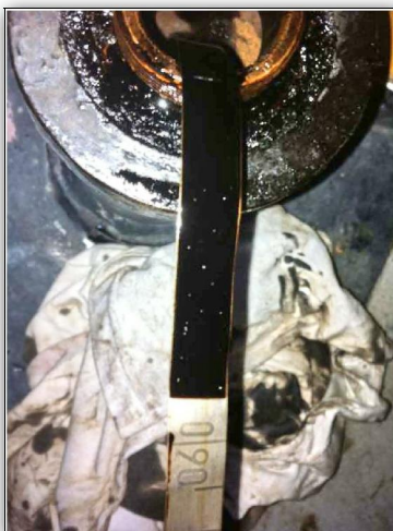
11- No bubbles seen