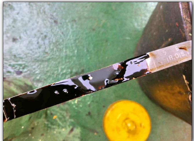
10- No bubbles seen. Clear reflection is an indication of good bunker supply