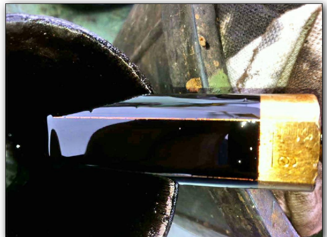
12- No bubbles seen