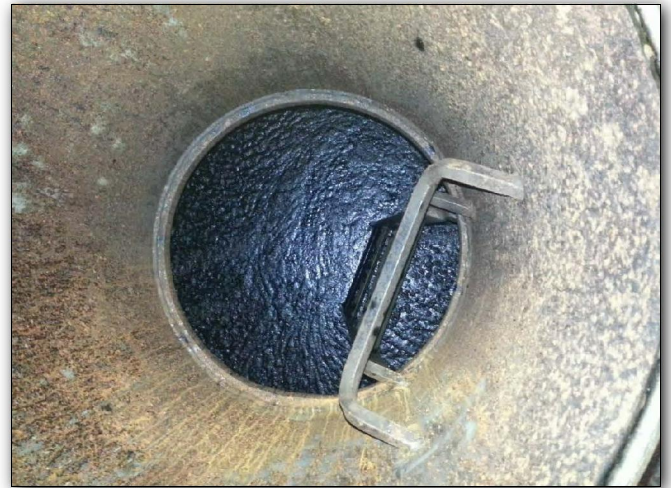
4- Two hours after bunkering - lot of bubbles seen