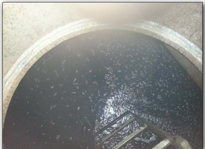
5- About 6 hours after bunkering - only light air bubbles seen - ullage 184 cm